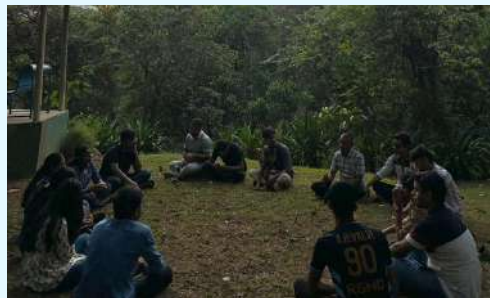
YMT AMC Team Sharing their TDFN Experiences