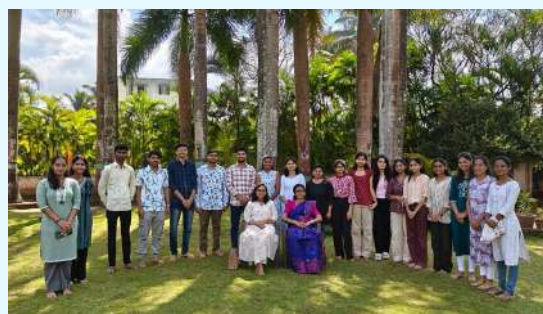
The Solapur-Kolhapur prant's Experience Sharing – TDFN event, attended by 25 students at Gadhinglaj, inspired service spirit and social awareness