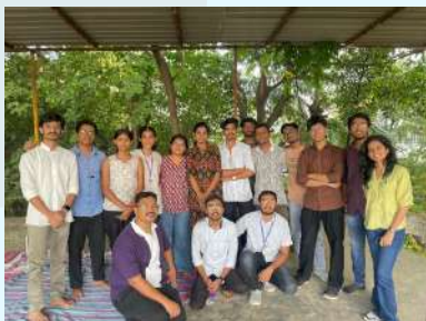
Sion Ayurved Team with their TDFN Experiences